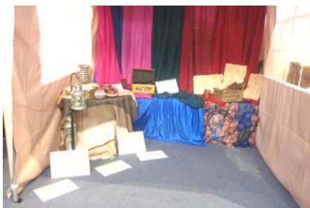
The tent of the Magi