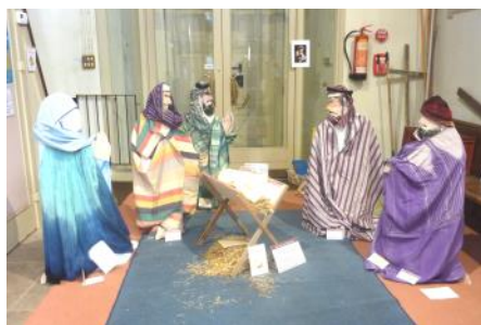
The Shepherds Visit the Crib

With the experience of two previous years, the installations all seemed neater, smarter and less intrusive this year and lent themselves to leaving in place until Epiphany.