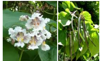
Flowers and seeds of the Indian bean tree

On the left of the drive leading to Three Rivers District Council Offices and the Police Station where it joins Northway there is a beautiful Indian Bean Tree ( Catalpa Bignonioides ), native to southeast North America and imported as an 'ornamental and street tree'. It has large clusters of white flowers hanging down in summer, somewhat bluebell-shaped and spotted with yellow and purple. In autumn and winter it has thin bean-like pods.