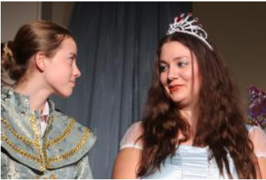
The Prince and Princess