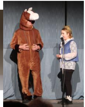
Horace the Horse, the Young Prince