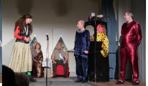
Duchess, Queen, King, Nott, Gaudy, Count