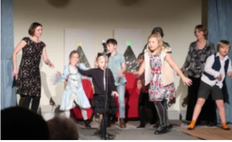
The children and chorus