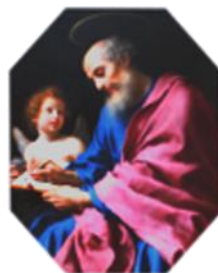
L to R: Inspiration of St Matthew, Caravaggio; Matthew, Rembrandt; Matthew, Carlo Dolci