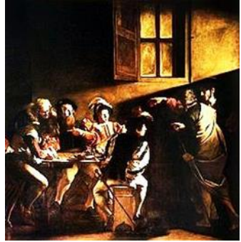
The Calling of Matthew

He obeyed that summons all the same, and the first thing he did then, so he tells us himself, was to throw a dinner-party for his fellow tax-collectors in Capernaum to meet this newcomer from Nazareth, as well as for a crowd of what he calls sinners but whose sins he does not specify.